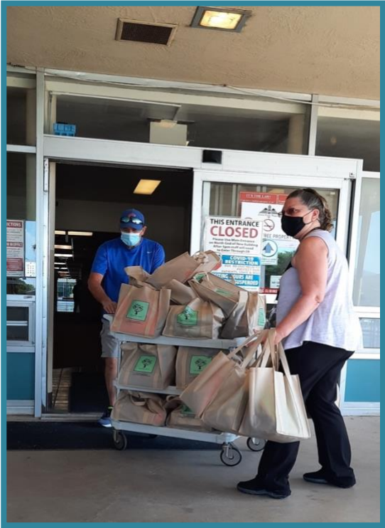
Volunteers and members working hard to distribute bags to community members